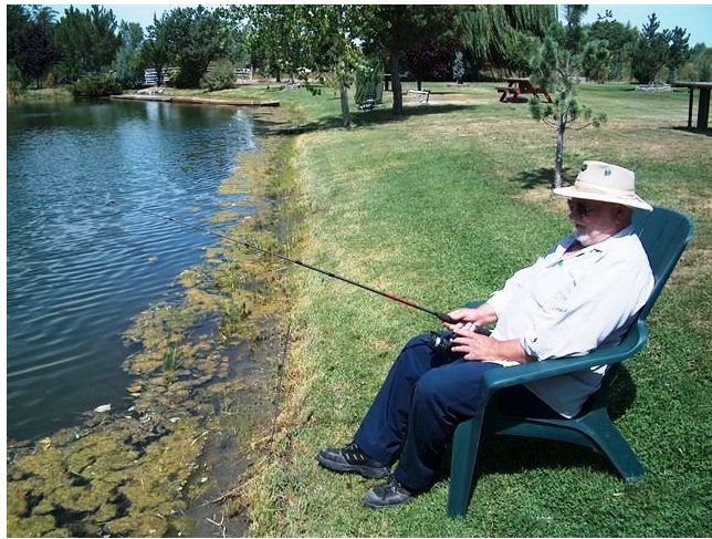
The old Commandant at ease and wondering where the next meal is coming from. Mess Sgt !